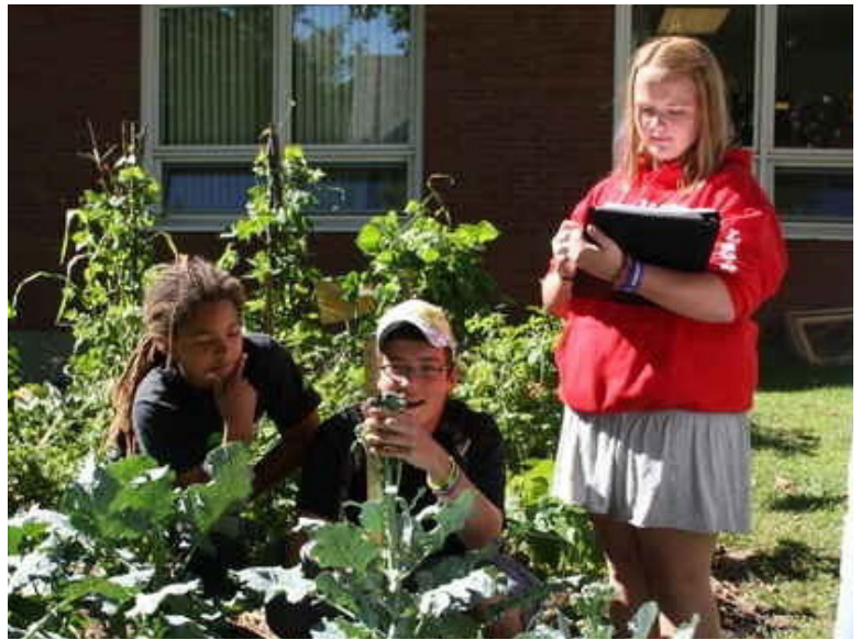
NORTHFIELD HS STUDENTS GARDENING

Educators work in many different contexts, throughout all grade levels and even outside the formal school setting. Grade school teachers work full-time and often spend time outside of school hours grading papers and preparing lessons. Grade school teachers work the 10-month school year and have a 2-month break during summer, during which they may teach summer programs. Postsecondary teachers work both full-time and part-time. Part-time postsecondary teachers often have a full-time job in their field of expertise in addition to their teaching position. Postsecondary teachers can have flexible schedules, but are generally on campus during normal working hours to teach classes and hold office hours. Some postsecondary teachers teach summer courses or conduct research during the summer.