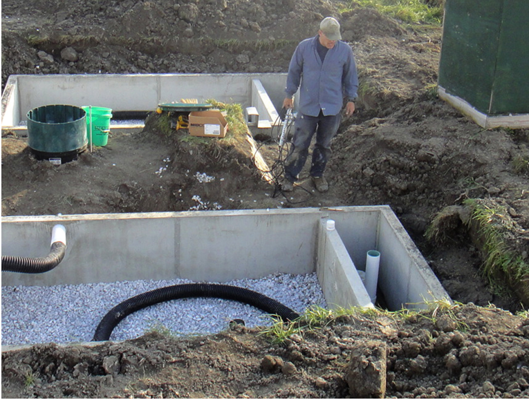
INSTALLING WATER QUALITY TECHNOLOGY.

Apply knowledge of engineering technology and biological science to agricultural problems concerned with power and machinery, electrification, structures, soil and water conservation, and processing of agricultural products.