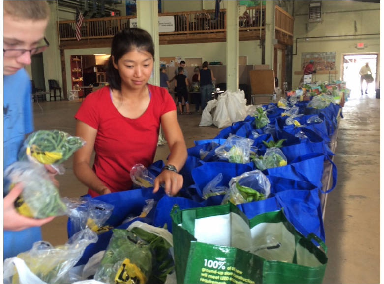
PACKING HEALTH CARE SHARES, CREDIT VFFC.