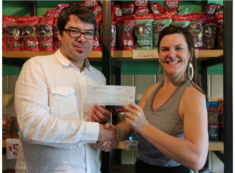
COMMUNITY CAPITAL OF VERMONT