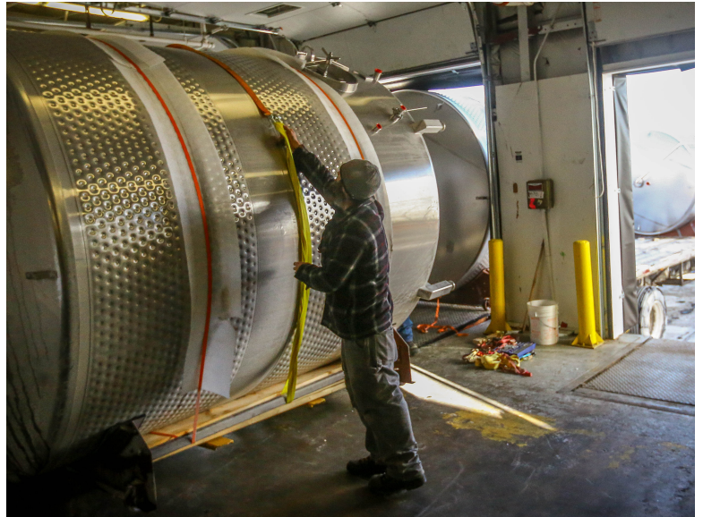
HARD CIDER MANUFACTURING

Qualities that employers look for when hiring in this field include analytical skills, critical thinking, problem solving skills, interpersonal skills, and speaking skills . Technical assistance workers must analyze client portfolios and are constantly working with numbers. Professionals in this career interact with clients often and must be able to make clients feel comfortable and be able to respond to questions and concerns.