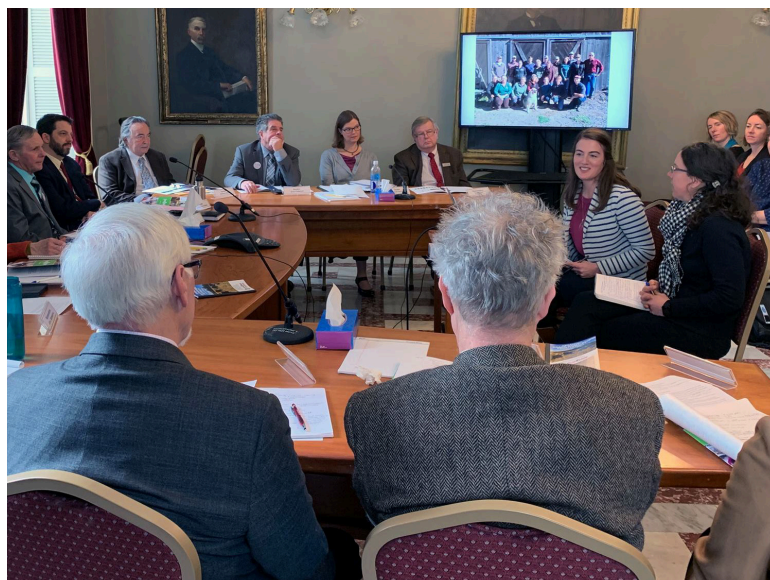
TESTIFYING TO THE VT STATE LEGISLATURE AG COMMITTEES

Employees or consultants who engage in advocacy or support community activism related to food and agriculture issues, for example employees of an anti-hunger nonprofit.