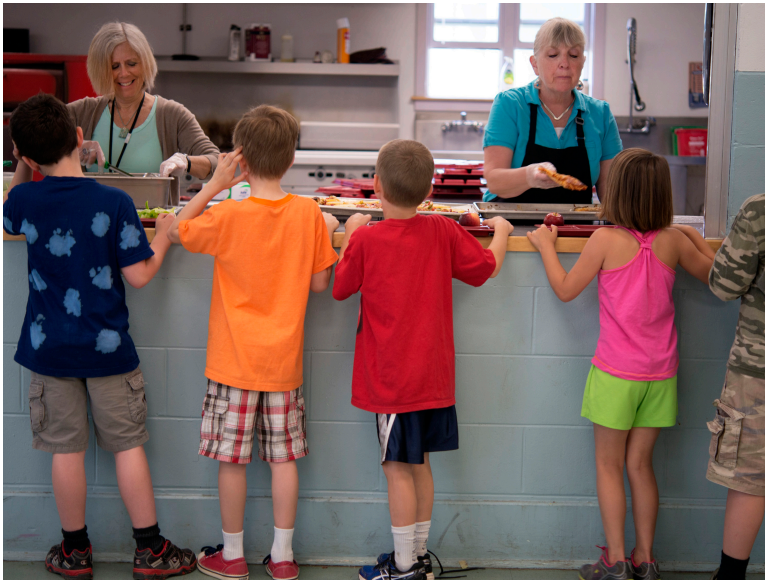
MONKTON CAFETERIA LINE

Food service managers or other food service workers in a school or healthcare setting.