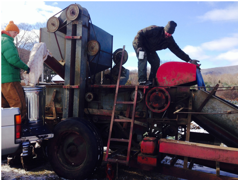
FARM MACHINERY IN USE AT YODER FARM

Diagnose, adjust, repair, or overhaul farm machinery and vehicles, such as tractors, harvesters, dairy equipment, and irrigation systems.