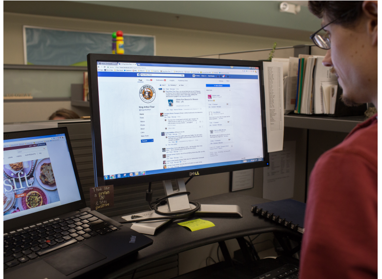
SOCIAL MEDIA MARKETING AT KING ARTHUR FLOUR