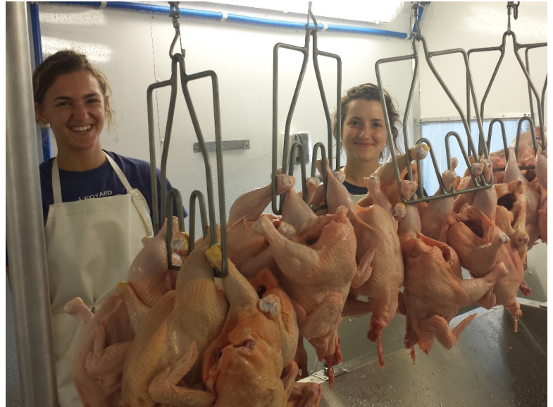
STUDENTS AT HANNAFORD CAREER CENTER